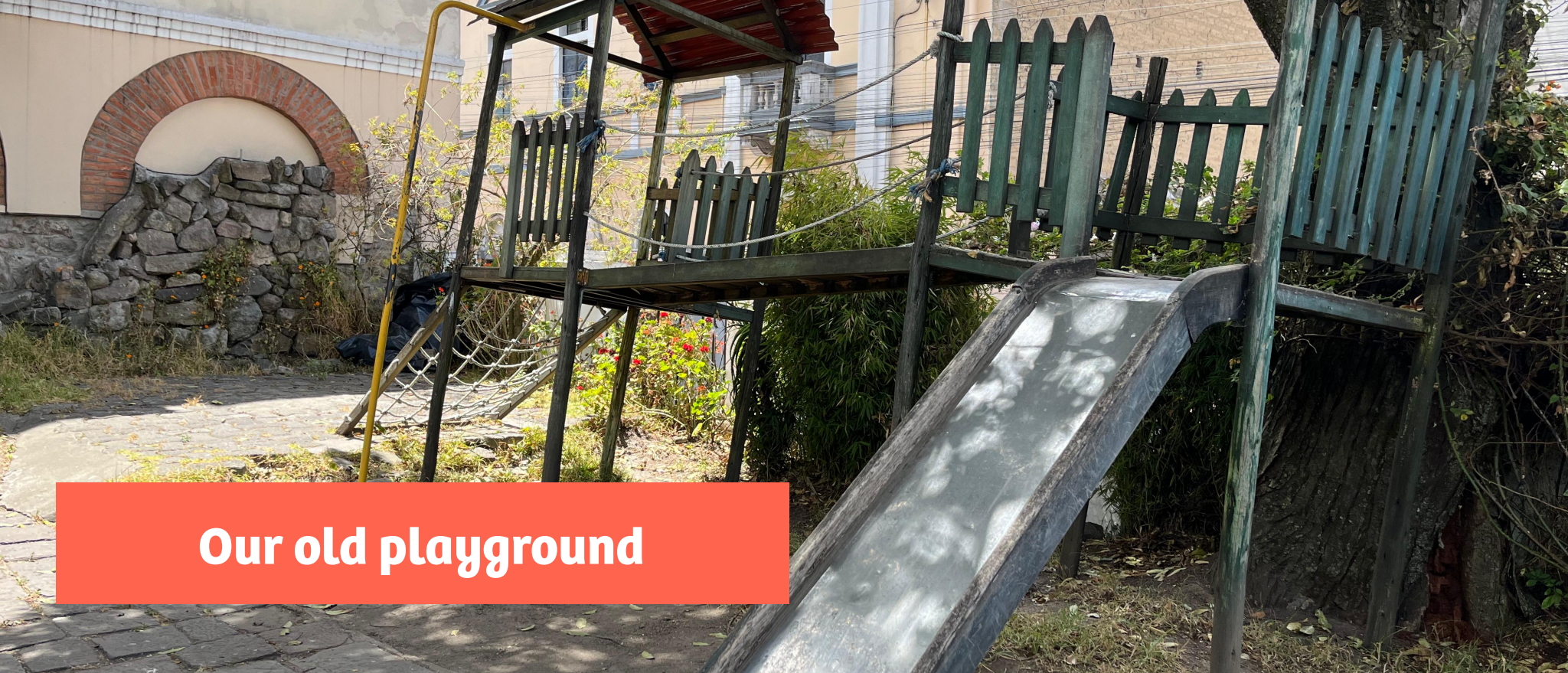
Our old playground