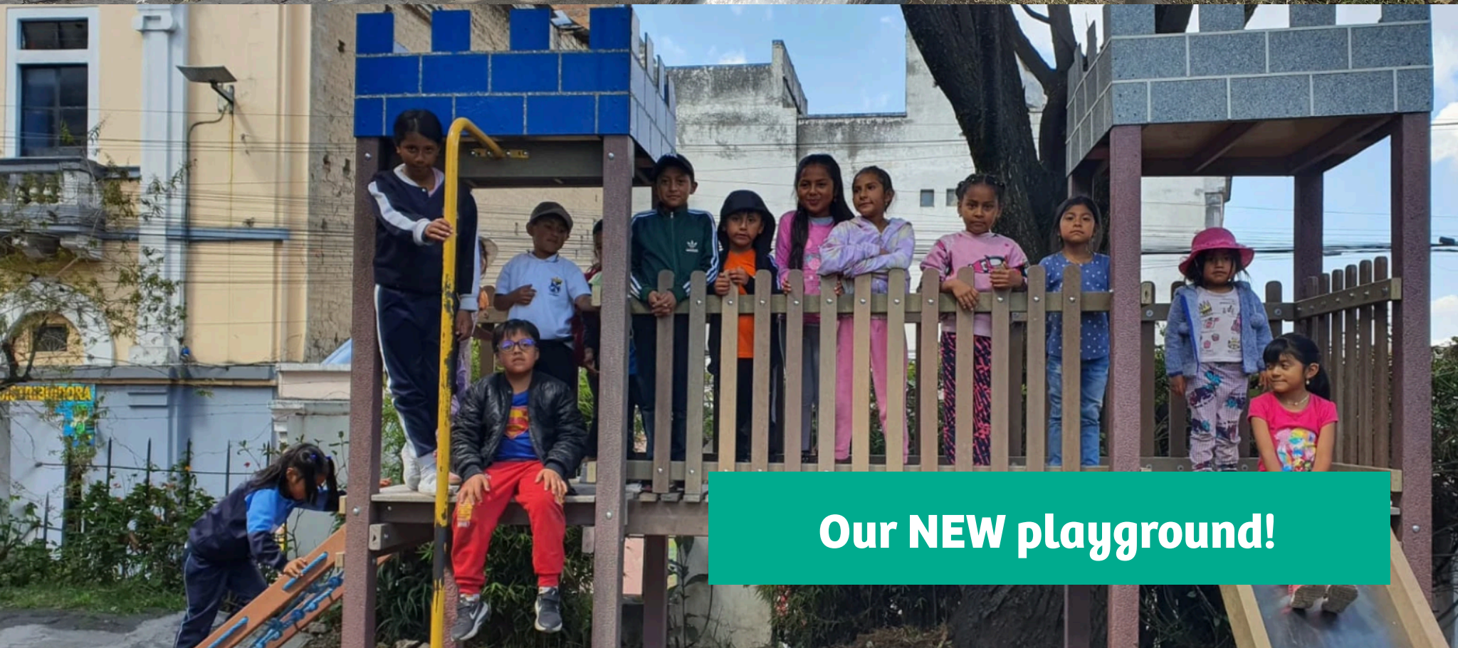
Our NEW playground!